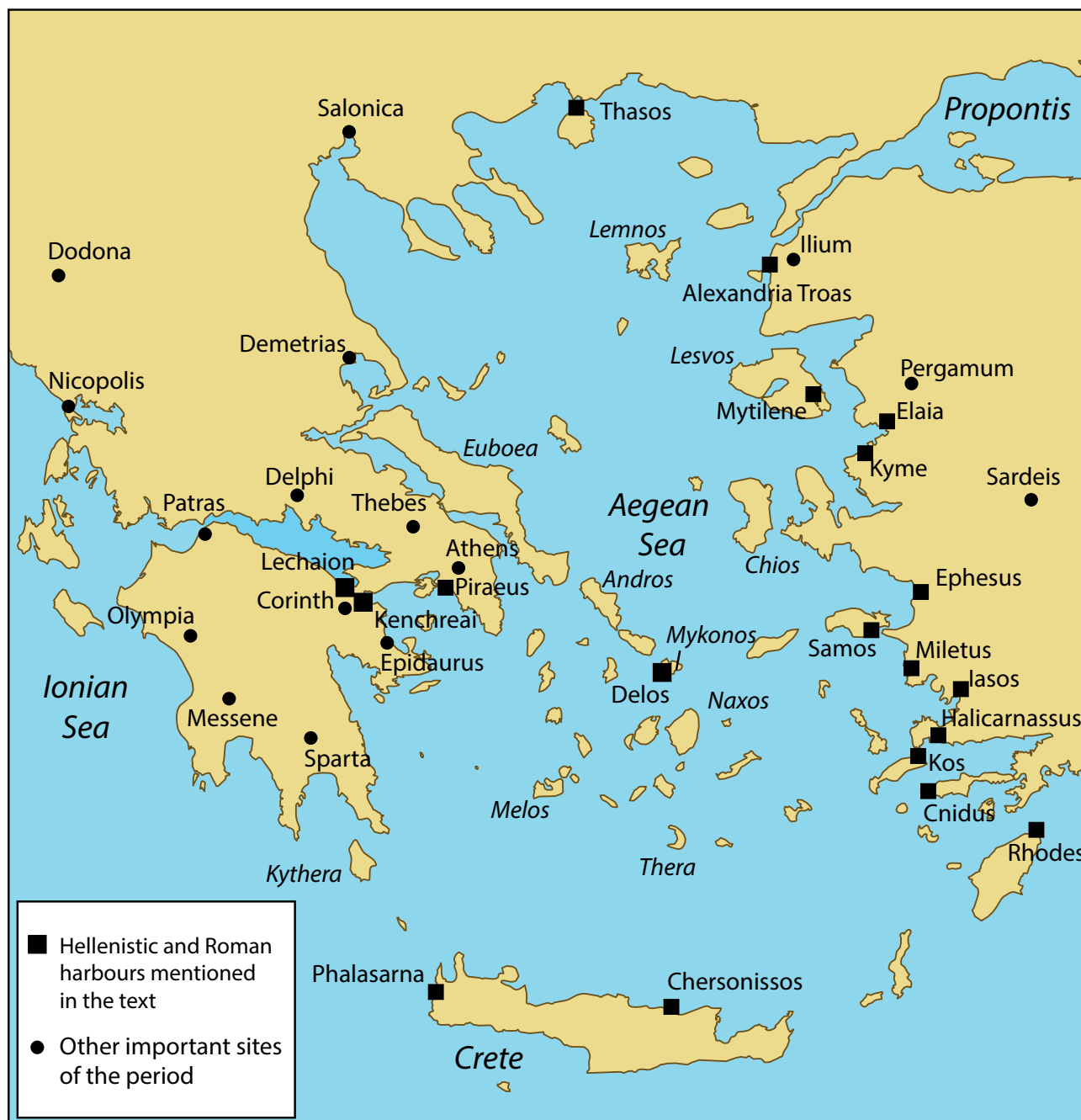
Figure 1.3. Map of the Aegean region, with the main Hellenistic and Roman harbours mentioned in the text (drawing by the author).

understanding through their reconstruction and analysis. Underwater investigations have also been undertaken at all three sites and have provided first-hand evidence for their form and function.